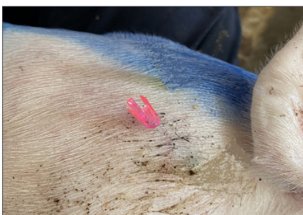
Figure 3: Highly visible extraction collar in pig