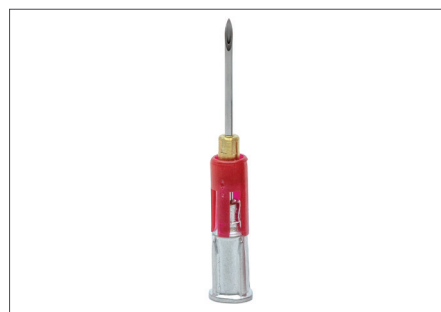
Figure 4: D3X needle assembly